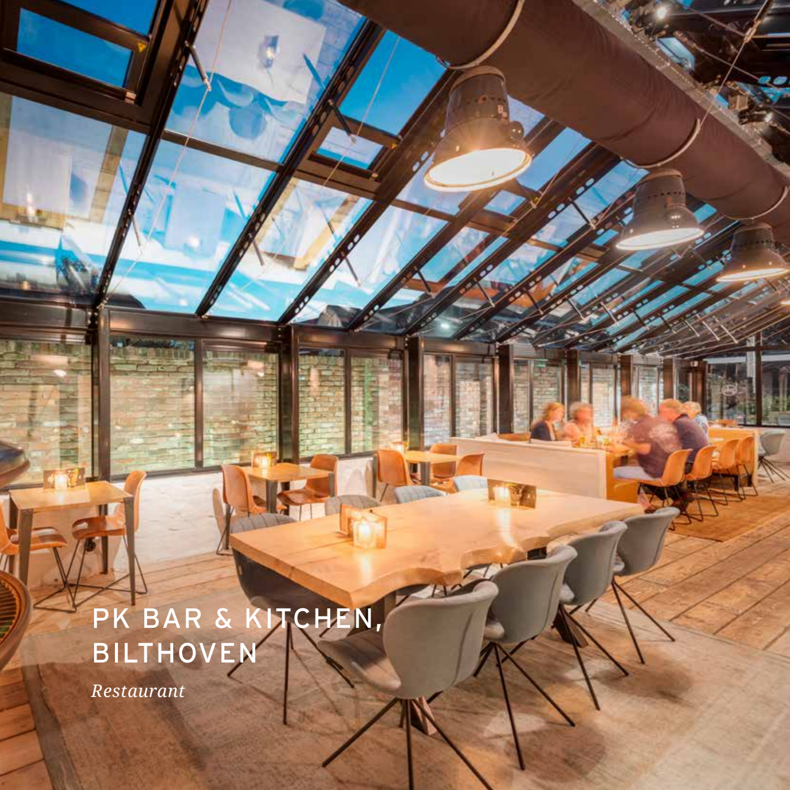
PK BAR & KITCHEN, BILTHOVEN Restaurant

LOCATION Bilthoven | Netherlands SOLUTION SDL Akzent Vision roof system