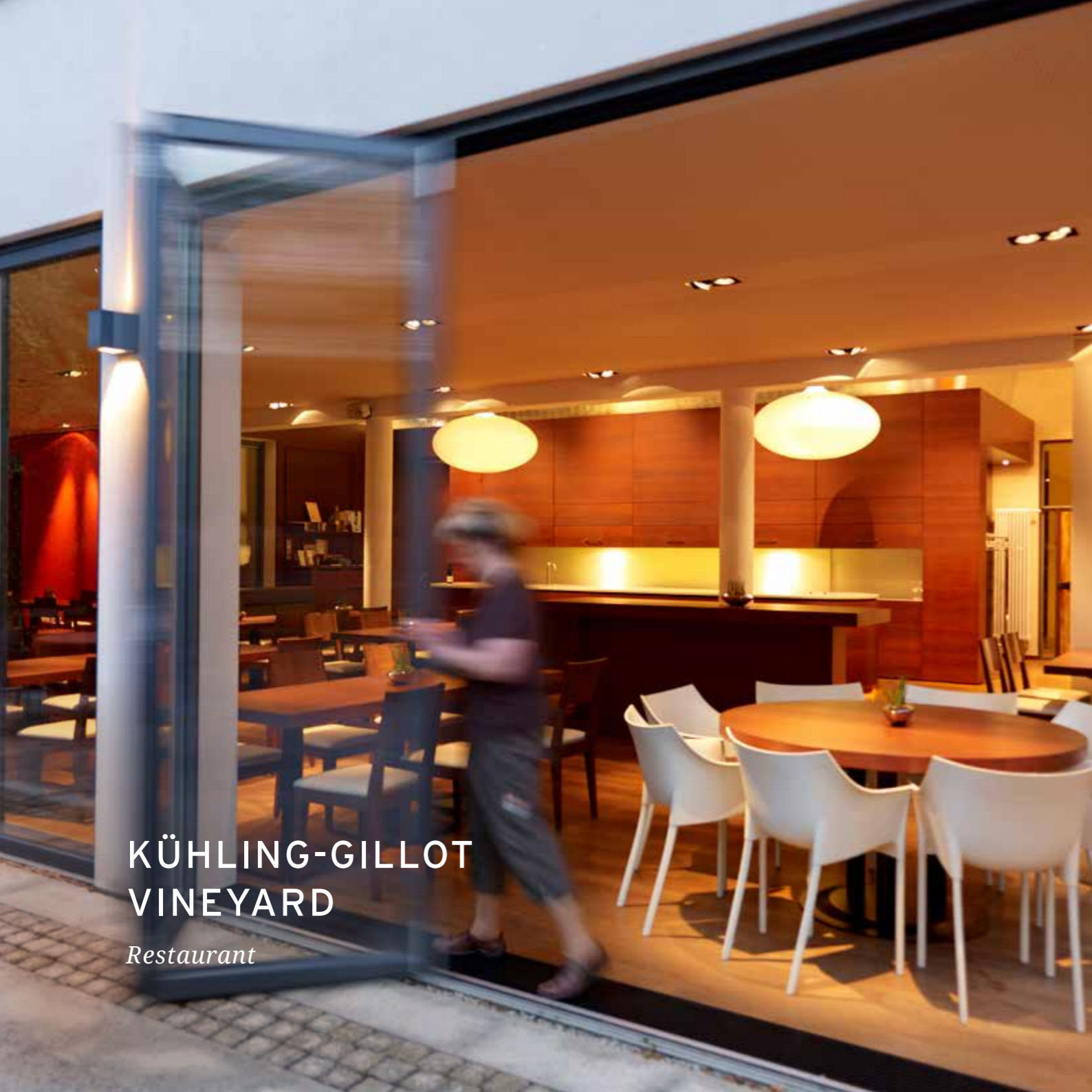
KÜHLING-GILLOT VINEYARD Restaurant

LOCATION Bodenheim | Germany SOLUTION SL 80 bi-folding door