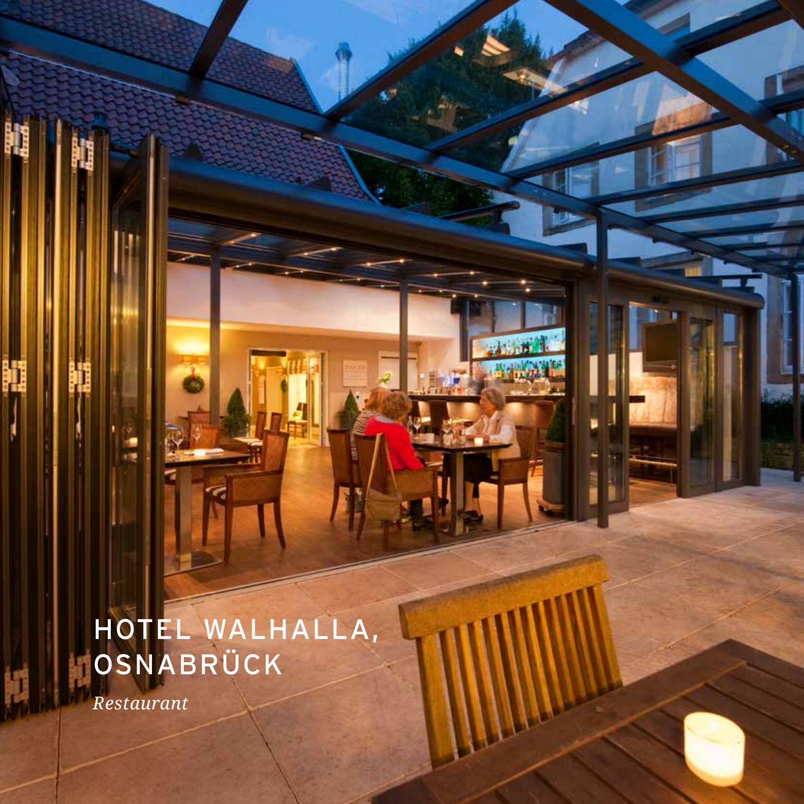
HOTEL WALHALLA, OSNABRÜCK Restaurant

ARCHITECT Planconcept Osnabrück | Germany LOCATION Osnabrück | Germany