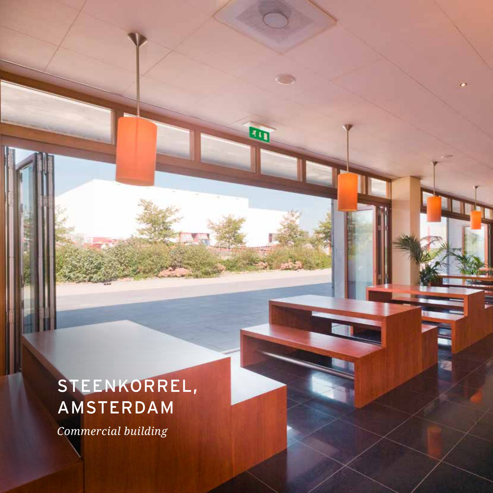
STEENKORREL, AMSTERDAM Commercial building

ARCHITECT Fkg Architecten BNA BV Koog aan de Zaan | Netherlands LOCATION Amsterdam | Netherlands